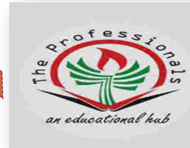
(An Educational Hub)